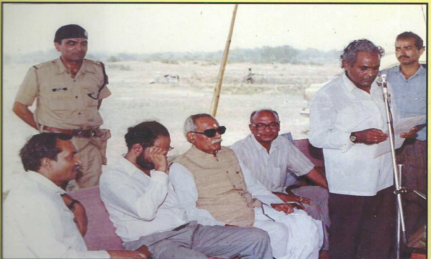
Foundation Laying ceremony on 05.06.1992