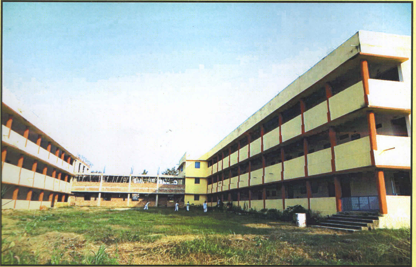
Building of Al-Habeeb Teacher's Training College Sector - VI, Bokaro Steel City - 827006 (Jharkhand)